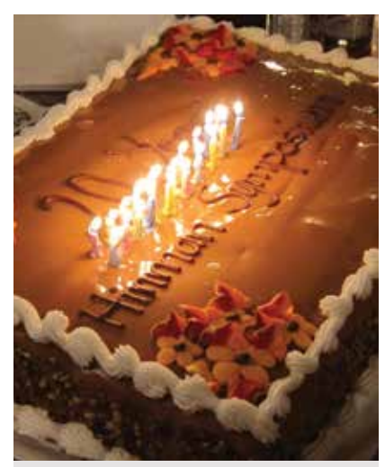
Celebration cake for the 20th year of the UT Hinman Symposium.