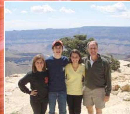
The family at the North Rim of the Grand Canyon.