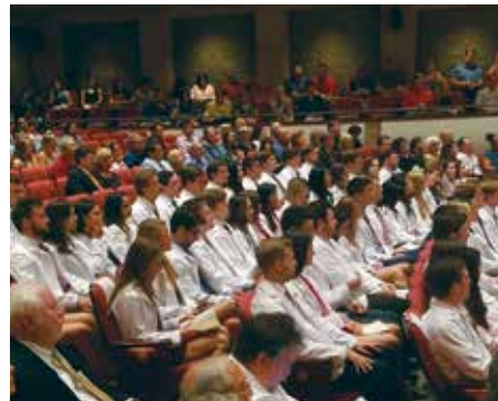
UAB dental school freshmen receive their first "doctor" white coats.