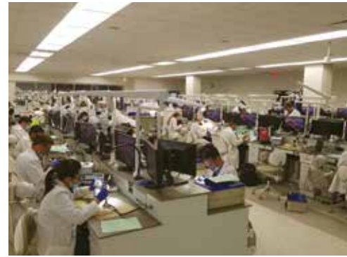
DCG dental students hard at work in the Thomas P. Hinman Learning Lab.