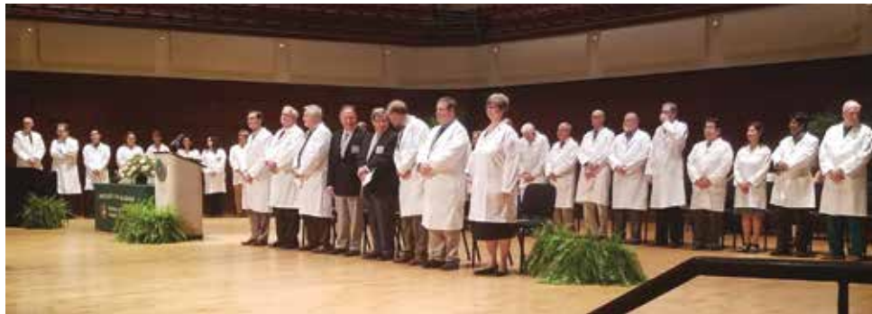
UAB faculty are on hand to personally welcome each student individually.