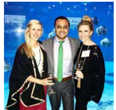
Hinman Members and their staffs enjoyed CE, networking and views of the belugas and whale sharks.