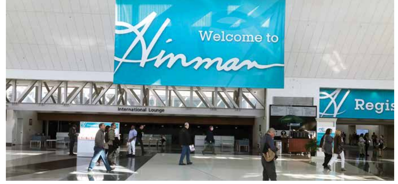
• Attendees head into the Thomas P. Hinman Dental Meeting in March 2019, the last time the event was held. This year, attendees will be participating online and in-person.