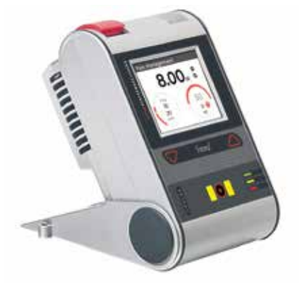
• The New XPulse from Fotona.

"Fotona dental lasers systems provide general dentists, periodontists, endodontists, pediatric dentists and hygienists the ability