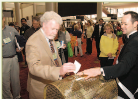
Prior to the Keynote Session, dozens line up to enter their tickets for a chance to win a new car.